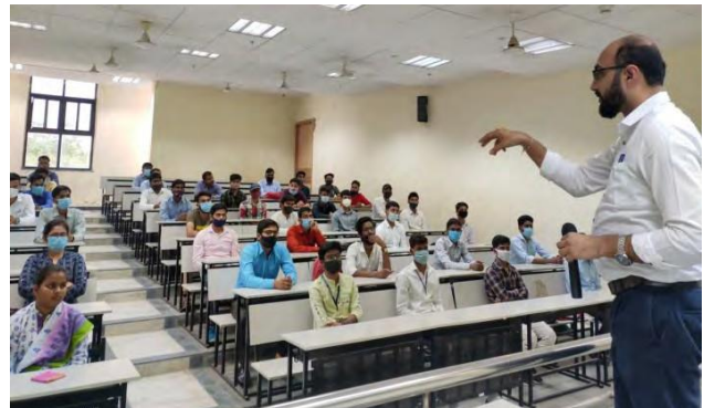
Snapshot from the Campus Drive of Axis Institute